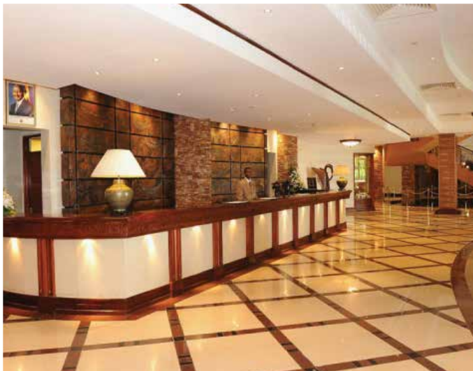
Top: Kampala Serena Hotel Lobby

Inaugurated in 2006, the Kampala Serena Hotel boasts of 152 luxury rooms and a state-of-the-art conference centre capable of catering to 1,500 delegates. Incorporating local materials and African art and design, the hotel is one of the largest employers in the country with some 420 staff, 97 percent of whom are Ugandan nationals while three percent are East African. In keeping with AKFED's policy, emphasis is placed on local hiring and sourcing so as to maximize direct and indirect benefits. mainly for the export market