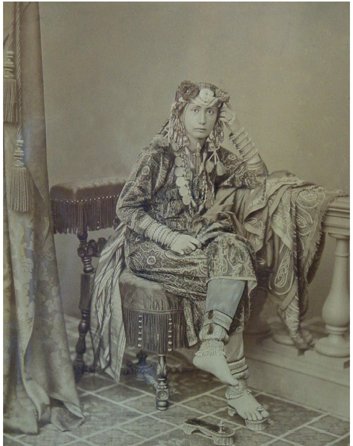
Princess Salme circa 1867

People grow up in Eastern lands without particular attention to any rules or care of health. ... The Arab [in Zanzibar] has no idea of classifying diseases. He knows but two kinds, "pains in the body" and "pains in the head." To the first category belong any complaints affecting stomach, liver, or kidneys, while under the second he lists all manifestations of distress assailing the head, whether sunstroke or softening of the brain. No one ever discovers the fundamental cause of an illness, ...It seems to me that it were better to send female physicians to Zanzibar ... For my own part, I would willingly, if some association decided upon a suitable emissary, help her learn Arabic and Suahili - the least I could do for my beloved country. And the venture ought to be successful from a pecuniary point of view. But the doctor must be a woman. She could do more in the East than a dozen men. 25